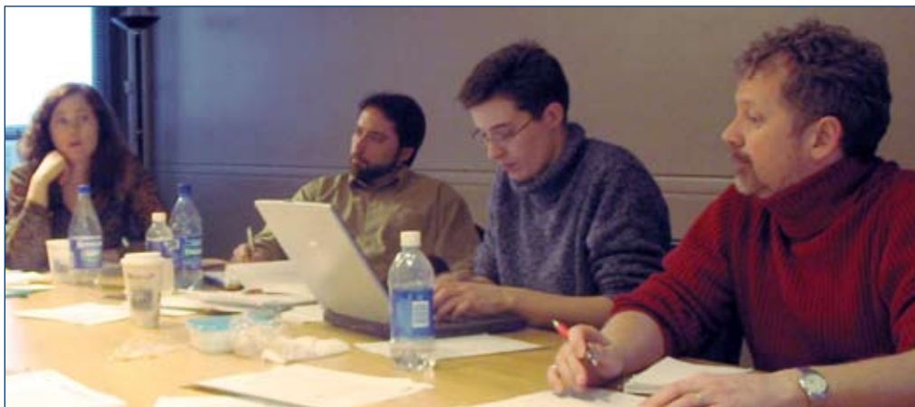
Face-to-Face Board meeting in Montréal February 21 2004

We implemented a 4-year business plan in 2002, which upon review achieved many of the goals that we set. A new plan will be released at the conference, which will map out the next 4 years.