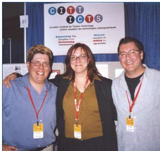
The CITT/ICTS delegation at Pacific Contact.

Haven't registered yet for CITT/ICTS's 16 th Annual conference and Trade Show in Toronto next August? Register before May 31 and save $50. CITT/ICTS Rendez-vous is an annual classic within the Canadian performing arts industry; it combines professional workshops and sessions, social events and unique networking opportunities for members and fellow colleagues from across the country. This year, the Toronto Committee has been working relentlessly in putting together a fantastic 4-day event centered around the theme ( Enter: The Building ) More than Bricks and Mortar . Check out conference details and schedule in this issue of