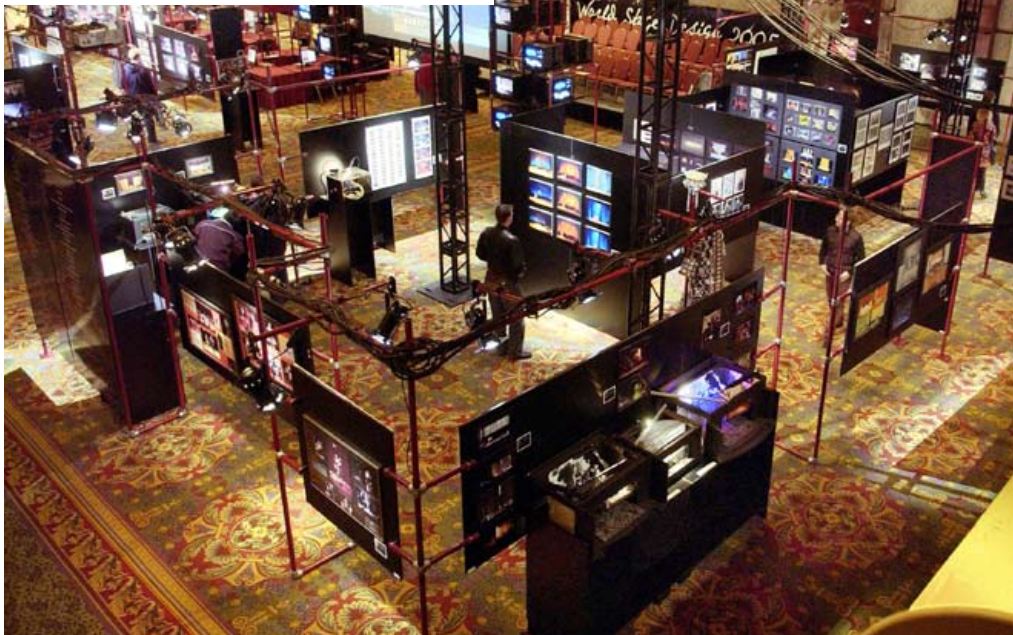
First Edition of World Stage Design 2005 at the Royal York in Toronto Ontario March 2005