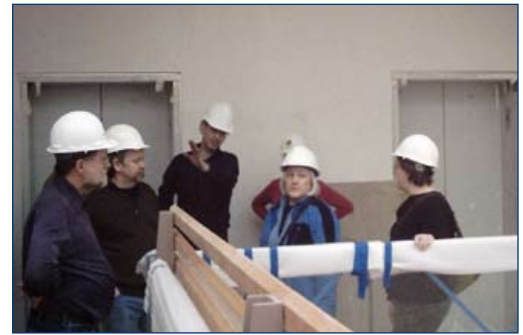
A small glimpse of the opera house tour...

Sign up before June 1 and save between $20 to $100 on pre-conference workshops and full conference registration fees. Check out the schedule that can be found in this issue of StageWorks, and come join fellow colleagues from across the country at this unique event dedicated to performing arts technologies.