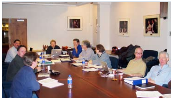
The CITT/ICTS Face-to-Face Board meeting at the Canadian Opera Company in Toronto

a freaky ice storm that started on Thursday February 16 and continued into Friday morning – the day the CITT/ICTS National Board members were to convene in Toronto for its annual face-to-face meeting