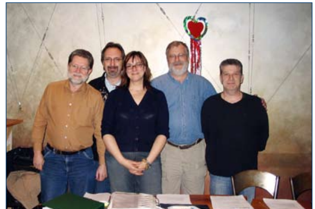
Le conseil d'administration CQICTS 2006: The CQICTS Board of Directors for 2006: