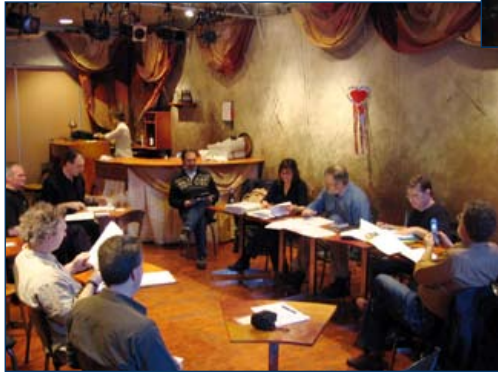
L'assemblée générale en action The AGM in full swing