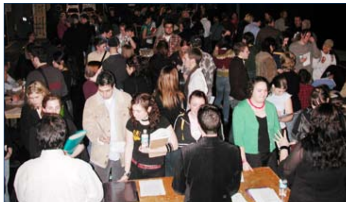
CITT Ontario Section Student Info Night attracted a huge crowd.

The first class of participants in the ETCP Rigging Certification process has graduated! Read the latest news on page 2 and visit www.etc.org for more details.