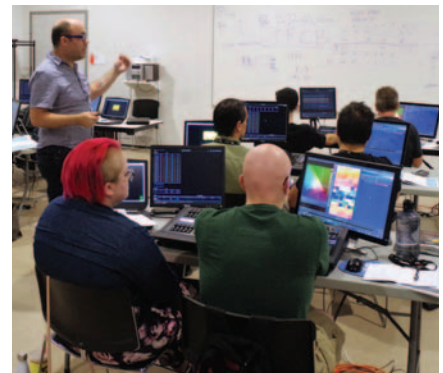
1. ETC Ion Xe training