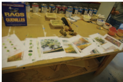
3. Foliage Techniques