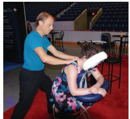
6. Wellness Lounge