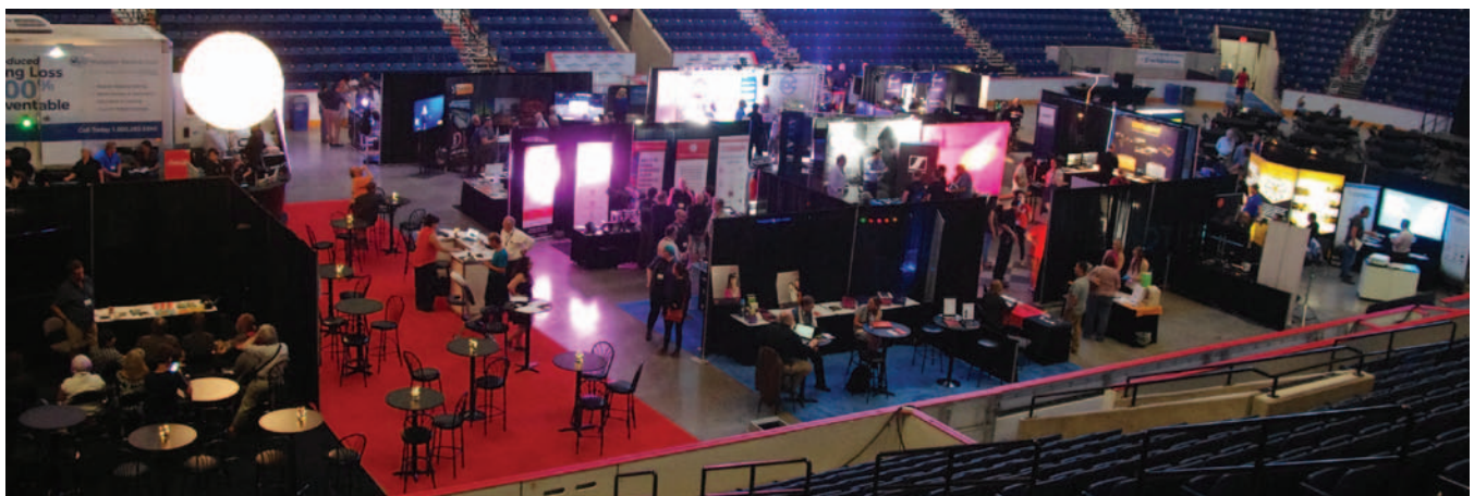
4. CITT/ICTS Rendez-vous 2018 trade show floor