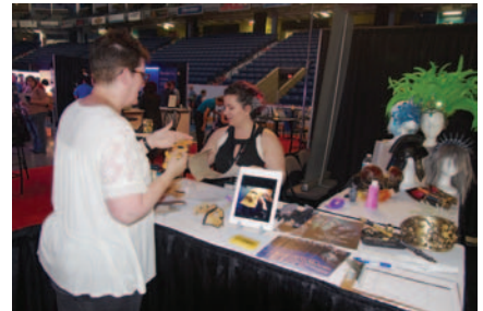
5. Hands-on with Worbla.