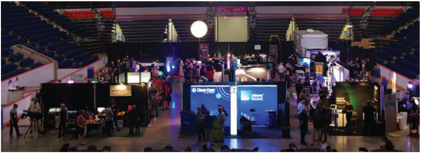
4. CITT/ICTS Rendez-vous 2018 trade show floor