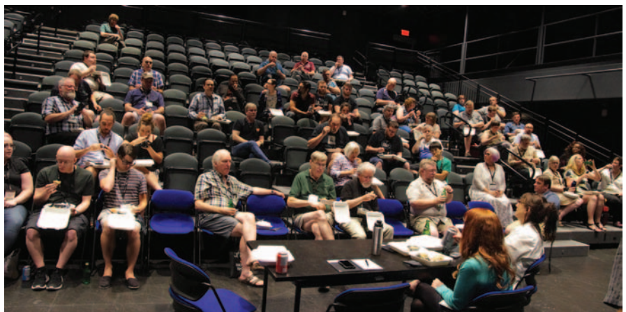
7. Brown Bag Luncheon discussion