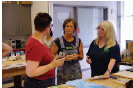
3. Foliage Techniques