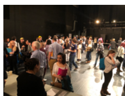
Job Fair on Ryerson Stage