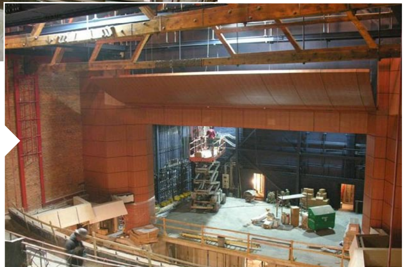
November 28 - View from the lighting booth showing the finished proscenium arch, the acoustic reflector, the box seats, and in the background, the completed rigging.